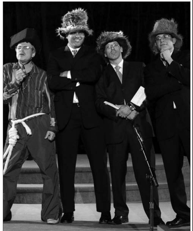
Haman & The Shmearacles