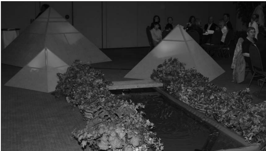
The Social Hall was transformed into the land of Egypt at Temple's Congregational Seder on April 9.